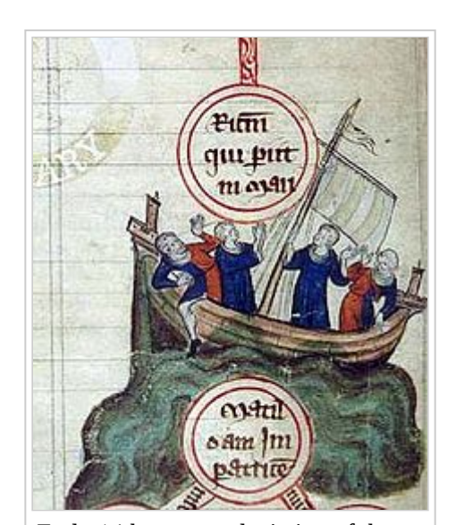
Early 14th-century depiction of the sinking of the White Ship on 25 November 1120

Henry's succession plans were thrown into chaos by the sinking of the White Ship on 25 November 1120. [260] Henry had left the port of Barfleur for England in the early evening, leaving William Adelin and many of the younger members of the court to follow on that night in a separate vessel, the White Ship . [261] Both the crew and passengers were drunk and, just outside the harbour, the ship hit a submerged rock. [262] [nb 26] The ship sank, killing as many as 300 people, with only one survivor, a butcher from Rouen. [262] Henry's court was initially too scared to report William's death to the King. When he was finally told, he collapsed with grief. [264]