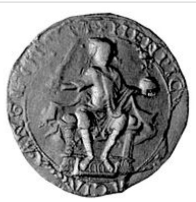
Henry's royal seal, showing the King on horseback (l) and seated on his throne (r)

South Wales.<sup>[152]</sup> Normandy was controlled via various interlocking networks of ducal, ecclesiastical and family contacts, backed by a growing string of important ducal castles along the borders.<sup>[153]</sup> Alliances and relationships with neighbouring counties along the Norman border were particularly important to maintaining the stability of the Duchy.<sup>[154]</sup>