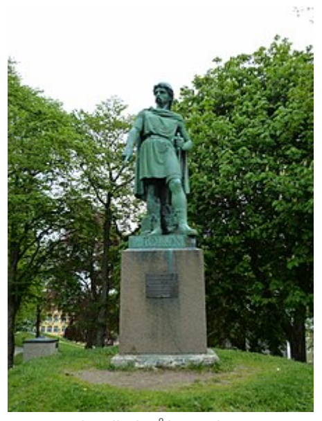
Statue of Rollo in Ålesund, Norway

A biography of Rollo, written by the cleric <u>Dudo of Saint-Quentin</u> in the late 10th century, claimed that Rollo was from Denmark ("Dacia"). One of Rollo's great-grandsons and a contemporary of Dudo was known as <u>Robert the Dane</u>. However, Dudo's Historia Normannorum (or Libri III de moribus et actis primorum