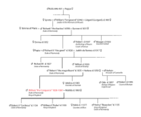
A genealogical chart of the \underline{\text{Norman}} dynasty

According to the medieval Irish text <u>An Banshenchas</u> and Icelandic sources, another daughter, Cadlinar (Kaðlín; Kathleen) was born in Scotland (probably to a Scots mother) and married an