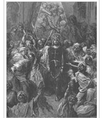
Louis IX was taken prisoner at the Battle of Fariskur, during the Seventh Crusade (Gustave Doré).

During the so-called "golden century of Saint Louis", the kingdom of France was at its height in Europe, both politically and economically. Saint Louis was regarded as "primus inter pares", first among equals, among the kings and rulers of the continent. He commanded the largest army and ruled the largest and wealthiest kingdom,