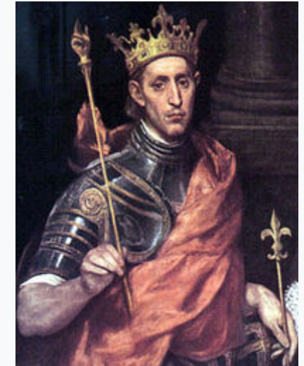
Saint Louis, painting by El Greco c. 1592 – 95.