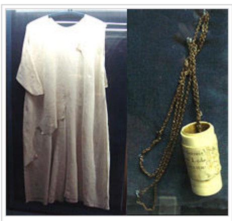
Hair shirt and scourge of Louis IX. Treasury of Notre-Dame de Paris.

In addition to Louis' legislation against usury, he expanded the scope of the Inquisition in France. The area most affected by this expansion was southern France where the Cathar heresy had been strongest. The rate of these confiscations reached its highest levels in the years before his first crusade, and slowed upon his return to France in 1254. In 1250, he headed a crusade, but was taken prisoner. During his captivity, he recited the Divine Office every day. After his release, he visited the Holy Land before returning to France.<sup>[5]</sup> In all these deeds, Louis IX tried to fulfill the duty of France, which was seen as "the eldest daughter of the Church" ( la fille aînée de l'Église ), a tradition of protector of the Church going back to the Franks and Charlemagne, who had been crowned by the Pope Leo III in Rome in 800. Indeed, the official Latin title of the kings of France was Rex Francorum , i.e. "king of the Franks" (until Louis' grandfather's reign, Philip II whose seal reads Rex Franciae , i.e. "king of France"), and the kings of France were also