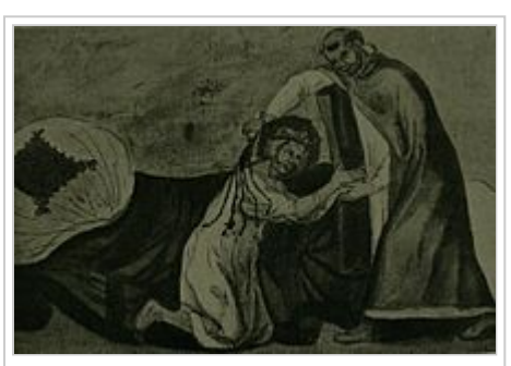
Louis IX allowing himself to be whipped as penance.

The perception of Louis IX as the exemplary Christian prince was reinforced by his religious zeal. Louis was a devout Catholic, and he built the Sainte-Chapelle ("Holy Chapel"),<sup>[6]</sup> located within the royal palace complex (now the Paris Hall of Justice), on the Île de la Cité in the centre of Paris. The Sainte Chapelle , a perfect example of the Rayonnant style of Gothic architecture, was erected as a shrine for what he believed to be the Crown of Thorns and a fragment of the True Cross, supposed precious relics of the Passion of Jesus. Louis purchased these in 1239–41 from Emperor Baldwin II of the Latin Empire of Constantinople, for the exorbitant sum of 135,000 livres (the construction of the chapel, for comparison, cost only 60,000 livres).