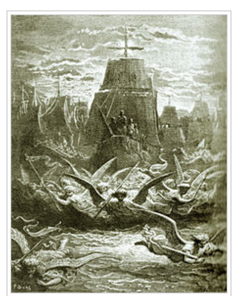
Engraving representing the departure from Aigues-Mortes of King Louis IX for the Seventh Crusade (by Gustave Doré).

In 1248 Louis decided that his obligations as a son of the Church outweighed those of his throne, and he left his kingdom for a sixyear adventure. Since the base of Muslim power had shifted to Egypt, Louis did not even march on the Holy Land; any war against Islam now fit the definition of a Crusade.<sup>[12]</sup>