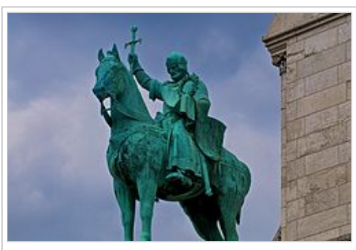
Equestrian statue of King Saint Louis at the Sacré-Cœur

In 1248 Louis decided that his obligations as a son of the Church outweighed those of his throne, and he left his kingdom for a sixyear adventure. Since the base of Muslim power had shifted to Egypt, Louis did not even march on the Holy Land; any war against Islam now fit the definition of a Crusade.<sup>[12]</sup>